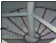
OPTIMAX® Fluidizing floor