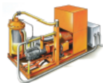
Compressor + Dryer