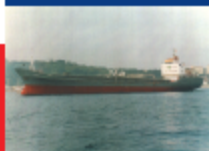
MV "FORTUNE R"