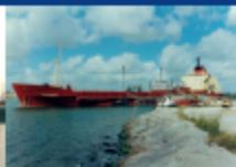
MV "CEM PUMPER"