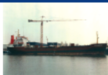
MV "CEM CRUSHER"